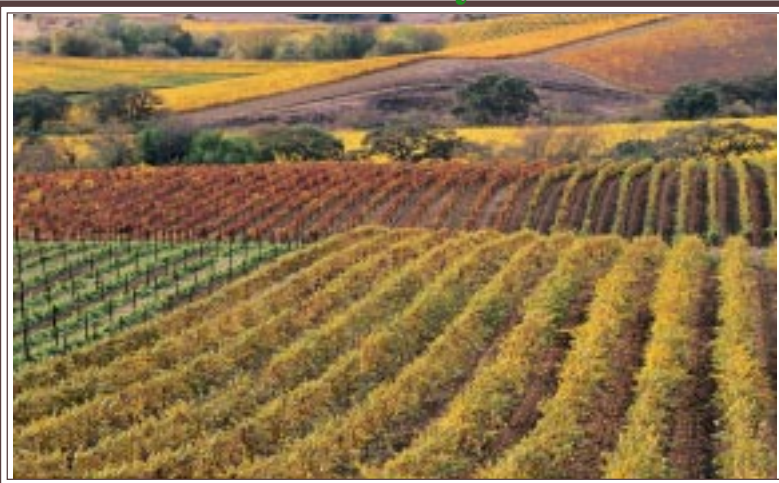
1st Place Master's Pictorial