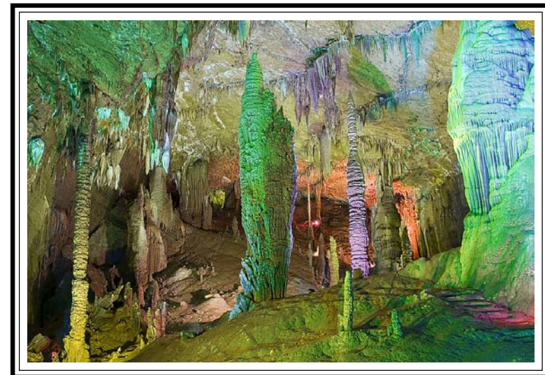
2nd Place PAAA