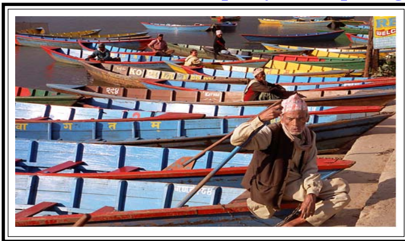
1st Place TA