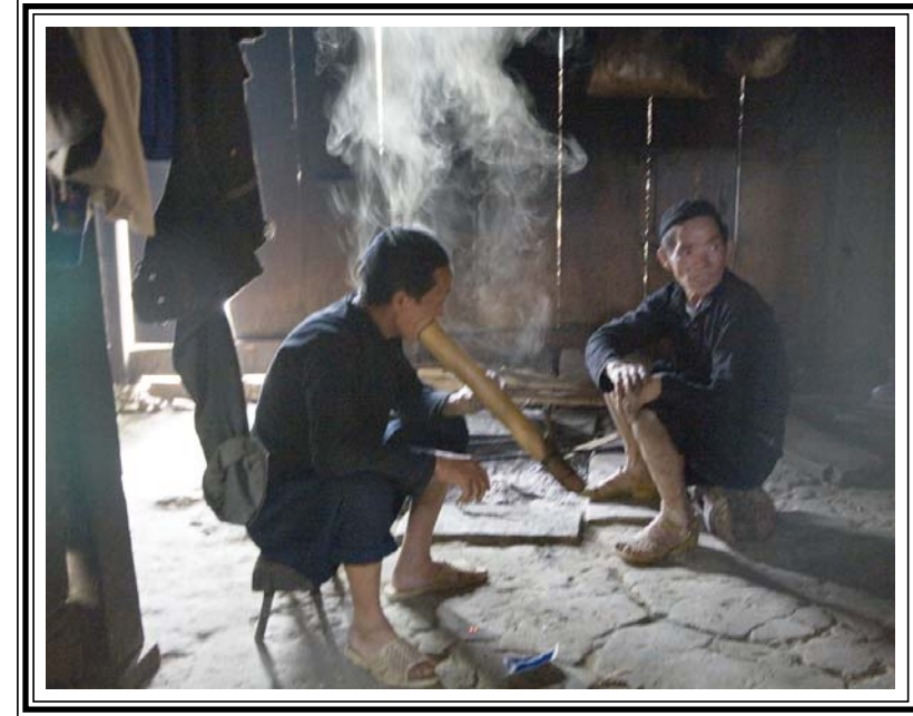
2nd Place TAA