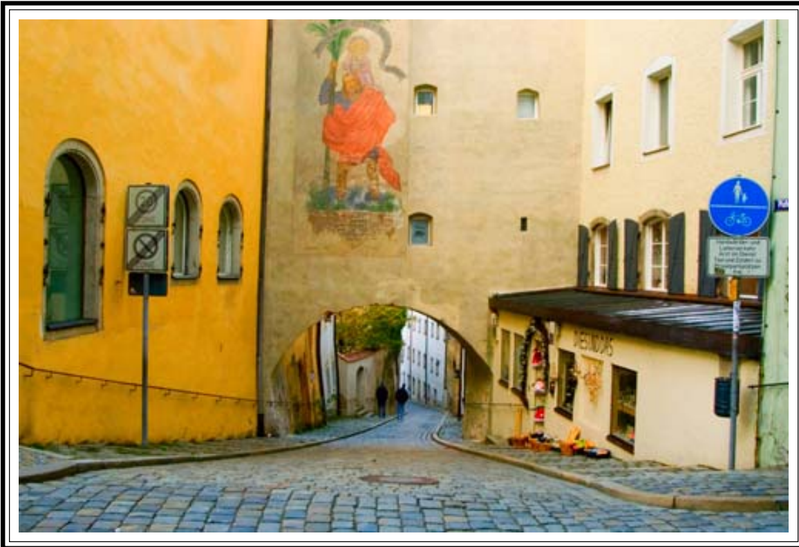
SOM: Traveling Down an Alley, Passau, Germany