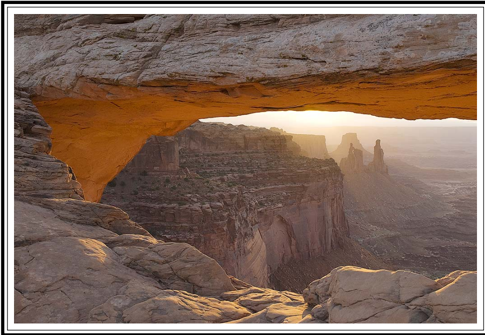
2nd Place TAAA