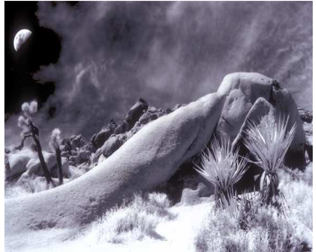
1st Place AA Pictorial