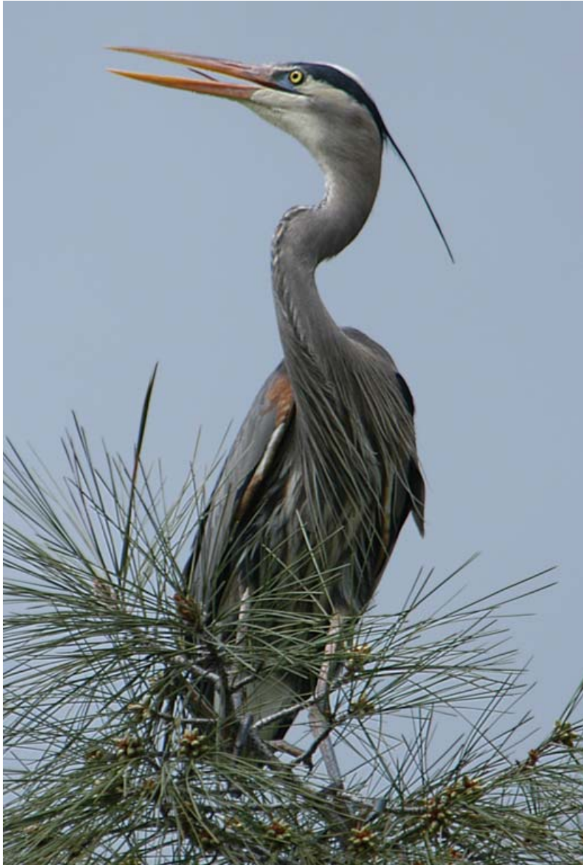
Great Blue Heron in Pine Tree by Bob Rogers 1st Place PAA