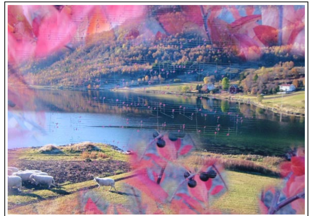
1st Place Creative Prints