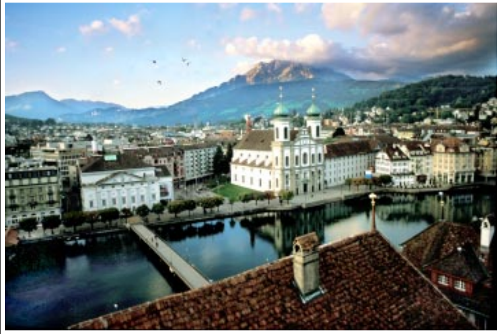
2nd Place Travel Slides AA